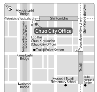
One minutes walk from Exit # 1of Shintomicho Station (Tokyo Metro Yurakucho Line)

This year, we are to visit “Tokyo Chuo City Tourist Information Center” sending out the charm and information of the City, “Ozu Museum” (Traditional Japanese paper) among various Machikado Museums set up for people to know several cultural resources remained in the City, and lastly "Comprehensive Sports Center" to help improve your health.