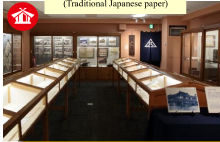
Ozu Museum (Traditional Japanese paper)